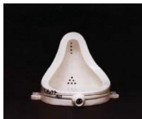
A porcelain toilet located in the entrance of the department of building design before installation. Right: Duchamp's urinal from 1921, readymade.

In the approach to ceramic art I sometimes miss the artist achieving a bird's-eye view of the art simultaneous with a very close contact to the material and the processing of it. This is where the relational aspect can become an important device. This is where space-specific art and the sculpture come in.