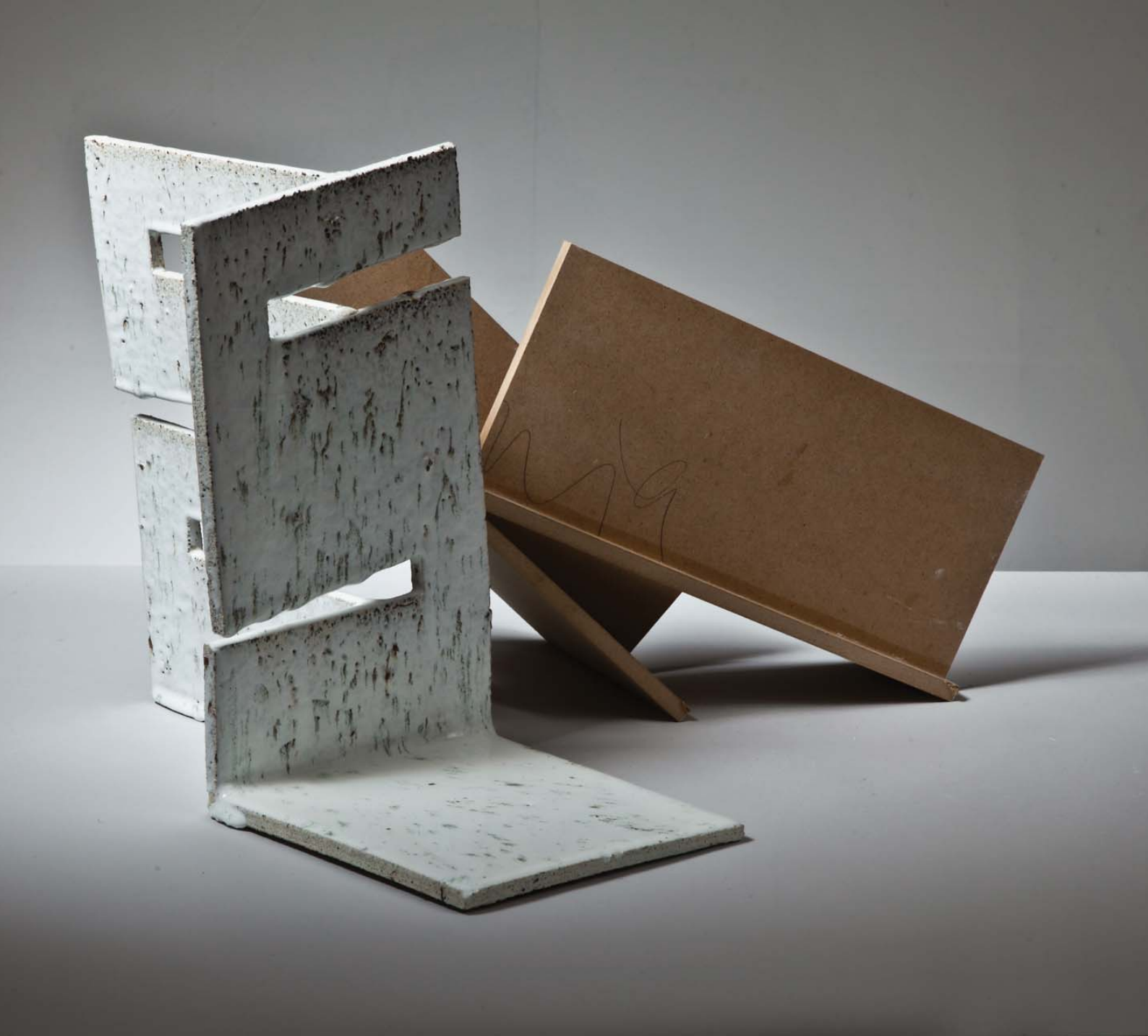
Object 7. Torsion. Ceramically glazed concrete. Height: 40 cm. 2010. Ceramic object. Anja Margrethe Bache.