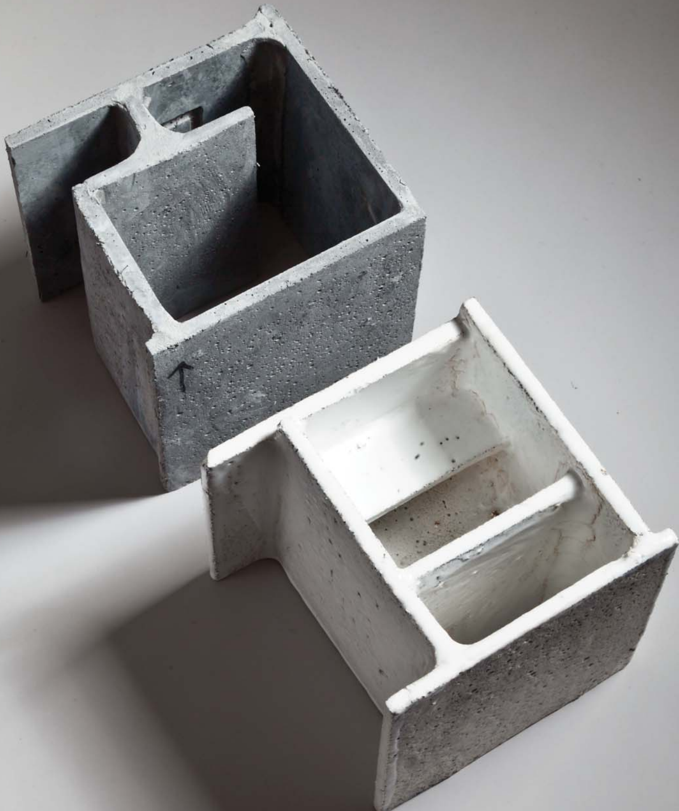
Object 13. Junction. Ceramically glazed concrete, ceramically fired unglazed concrete, concrete. Height: 40 cm. 2010. Ceramic objects. Anja Margrethe Bache.