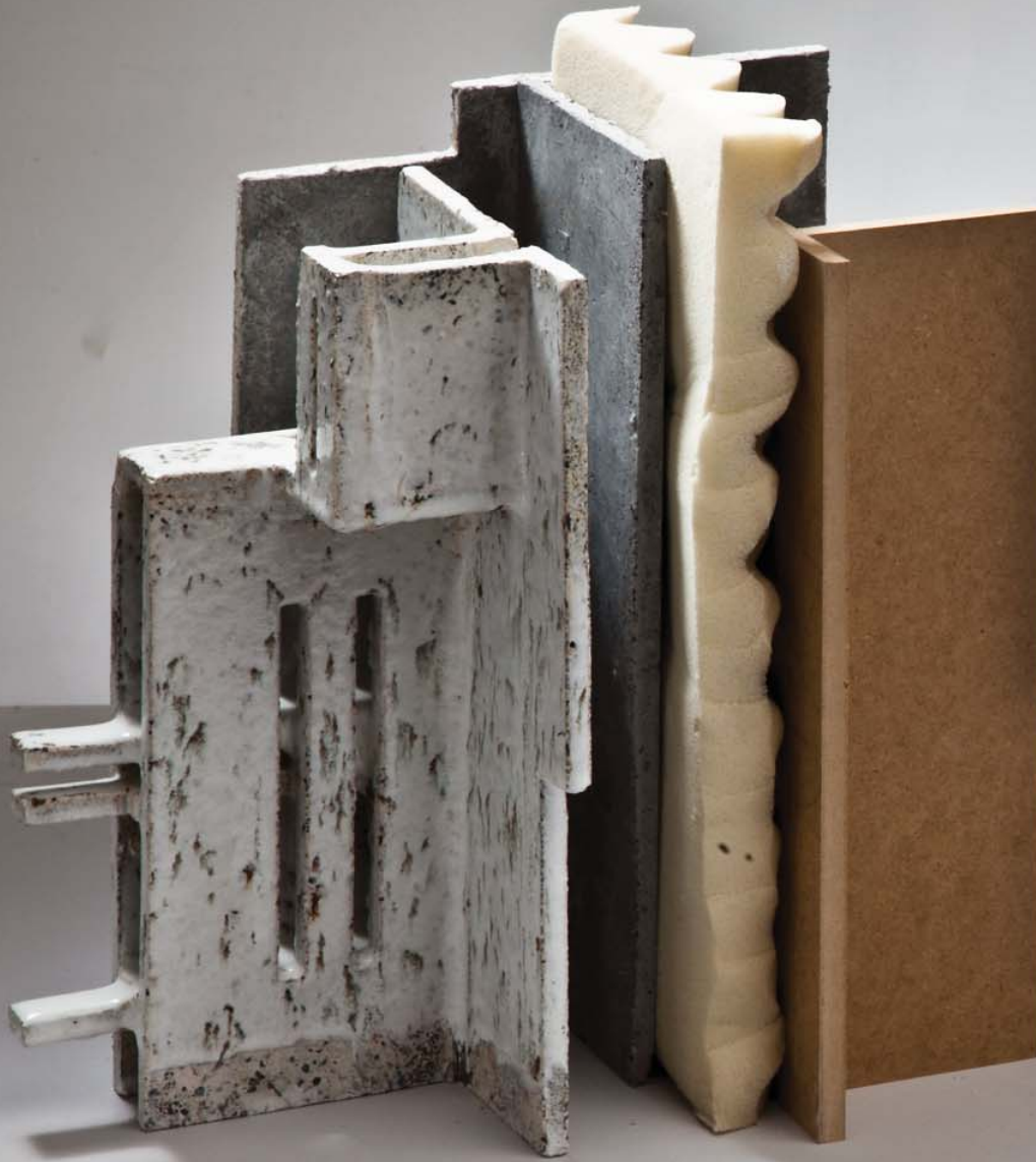
Object 4. Juxtaposition. Ceramically glazed concrete, concrete, wood, insulation, Height: 40 cm. 2010. Collection. Ceramically glazed concrete, concrete, tile, wood, height: 60 cm. 2010. Ceramic works. Anja Margrethe Bache.