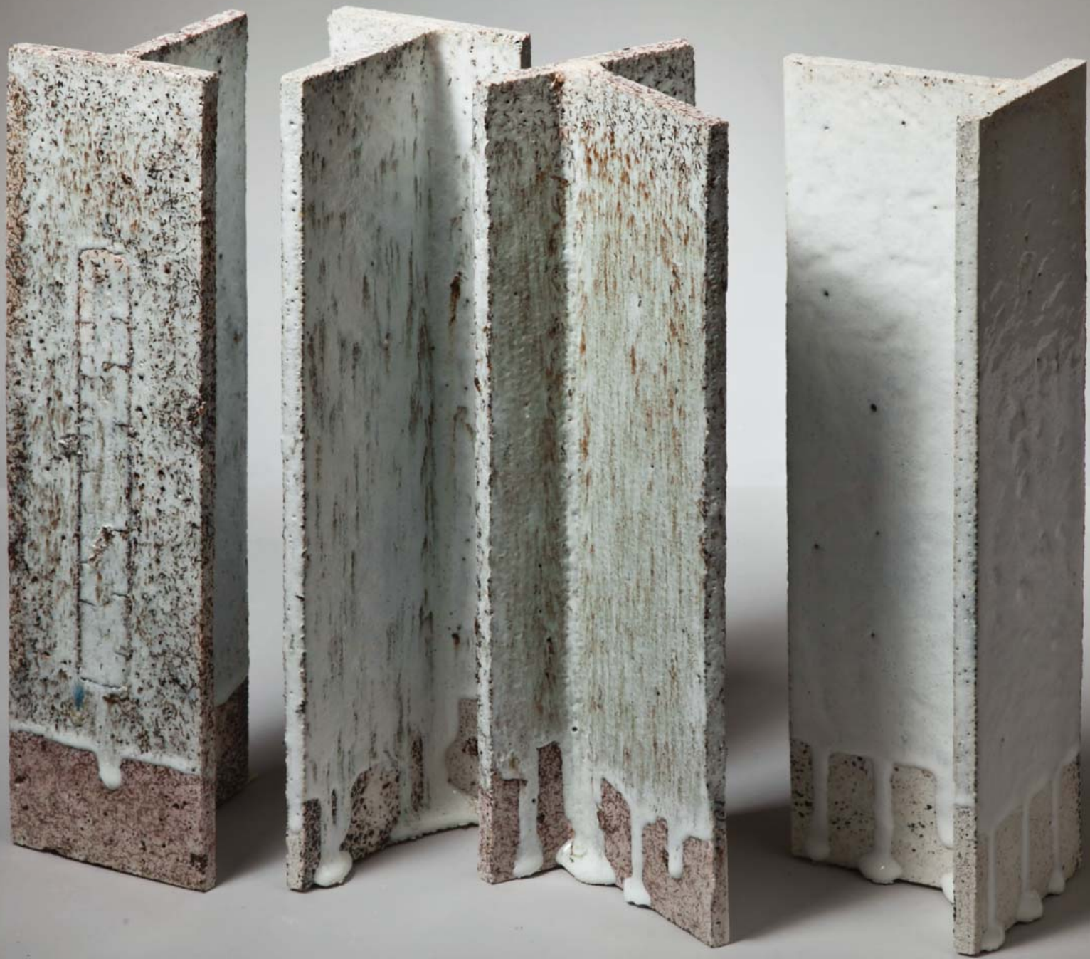
Object 20. Juxtaposition. Ceramically glazed concrete. Ceramically fired unglazed concrete. 40 cm. 2010. Ceramic objects. Anja Margrethe Bache.