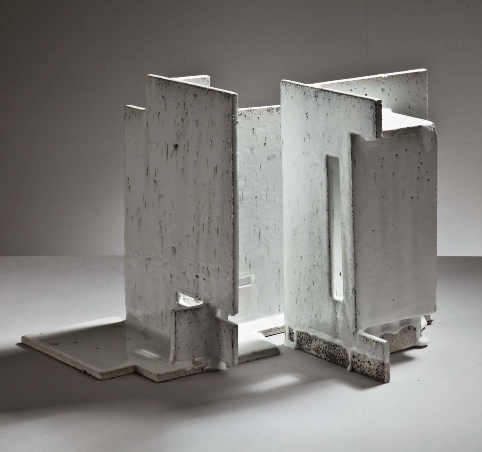
Object 9. Diffusion in space. Ceramically glazed concrete, fired unglazed concrete, wood. Height: 40 cm. 2010. Ceramic works. Anja Margrethe Bache.