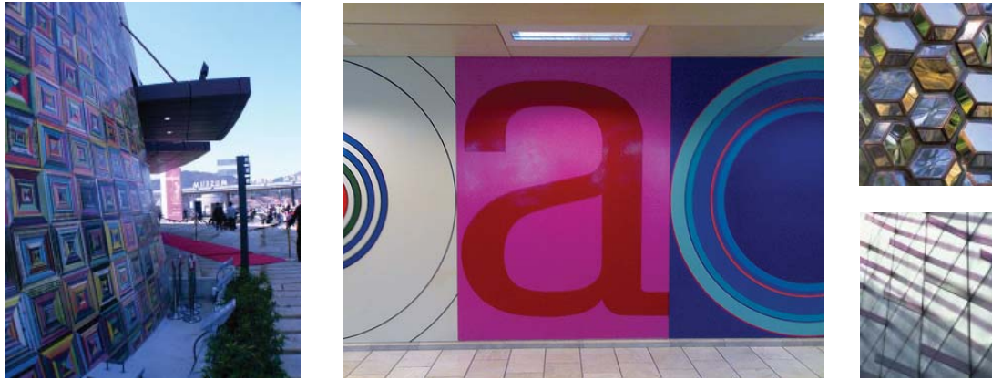
Examples of building integrated art. Shin Sang Ko's Gimhae Clayarch Museum, Poul Gerne's Herlev Hospital, Olafur Elisason's Quasibrick in the concert hall in Reykjavik, Iceland and James Carpenter's glass segments in World Trade Center 7, New York Photos retrieved online.

close dialogue with the architecture. We see it as specifically chosen and compounded colour codes, patterns and other kinds of surface treatment. Examples of this is Poul Gerne's interior decoration of Herlev Hospital and Shin Shang's façade at Gimhae Glyarch Museum. These are artistic solutions that stay on the façade level of the building.